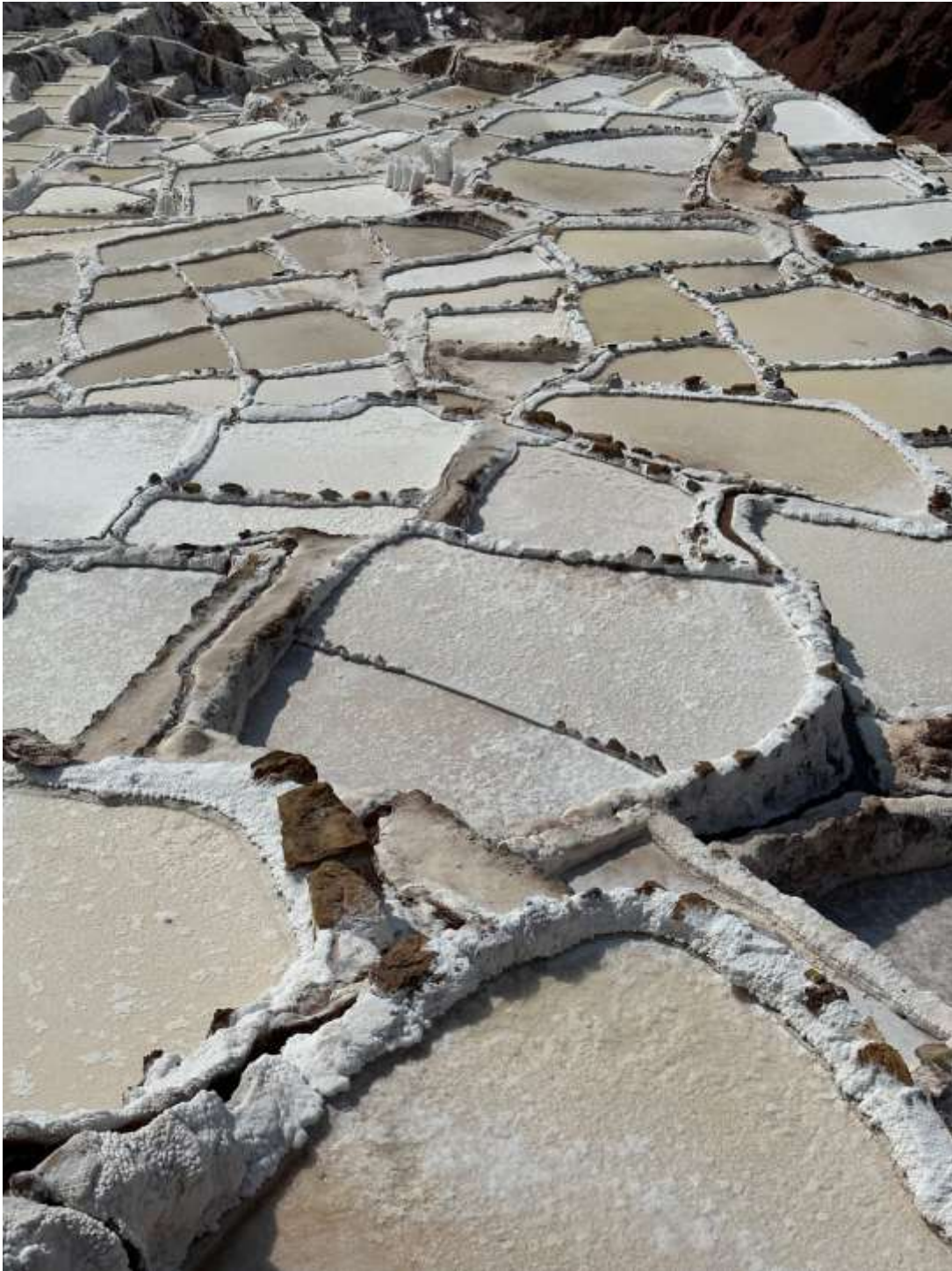
Maras Salt Pans

head to a local restaurant, where we'll savor a delicious meal crafted from fresh, locally-sourced ingredients. Get ready to indulge in a flavorful lunch that highlights the vibrant tastes of the region, offering an authentic and unforgettable dining experience. To conclude our enriching day, we will visit the ancient Maras Salt Pans, these historic salt pans have