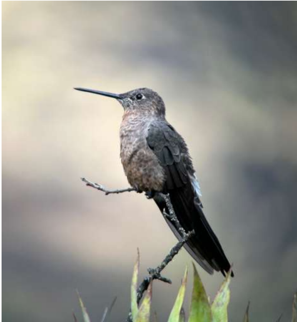
Giant Hummingbird

Immersed in the rich history and cultural resonance of the Cusco Valley, our journey today takes us on a short drive north of the city to the breathtaking Sacsayhuaman Archaeological Park situated at an elevation of 12,000 ft. We will explore the park's numerous sacred sites, trails, farming terraces and scenic vistas adorned with native flora of Polylepis, Gynoxys and Chachacomo trees mixed with Andean scrub offering the perfect habitat for a variety of special birds including the Tit-like Dacnis, the vibrant and territorial Sparkling Violetear and the elegant Tufted Tit-tyrant. As we continue our exploration, we may even encounter an array of water birds at the nearby Huayllarcocha Lagoon such as Puna Ibis, Slate-colored Coot, Andean Goose, Rufous-webbed Tyrant and the elusive Aplomado Falcon. Lunch will be at one of Cusco's finest restaurants, followed by an opportunity to explore the charming old town on foot, conveniently located near our hotel. As the day draws to a close, we invite you to join us for a special farewell dinner, reflecting on the unforgettable moments and experiences shared during our time in the enchanting land of the Incas.