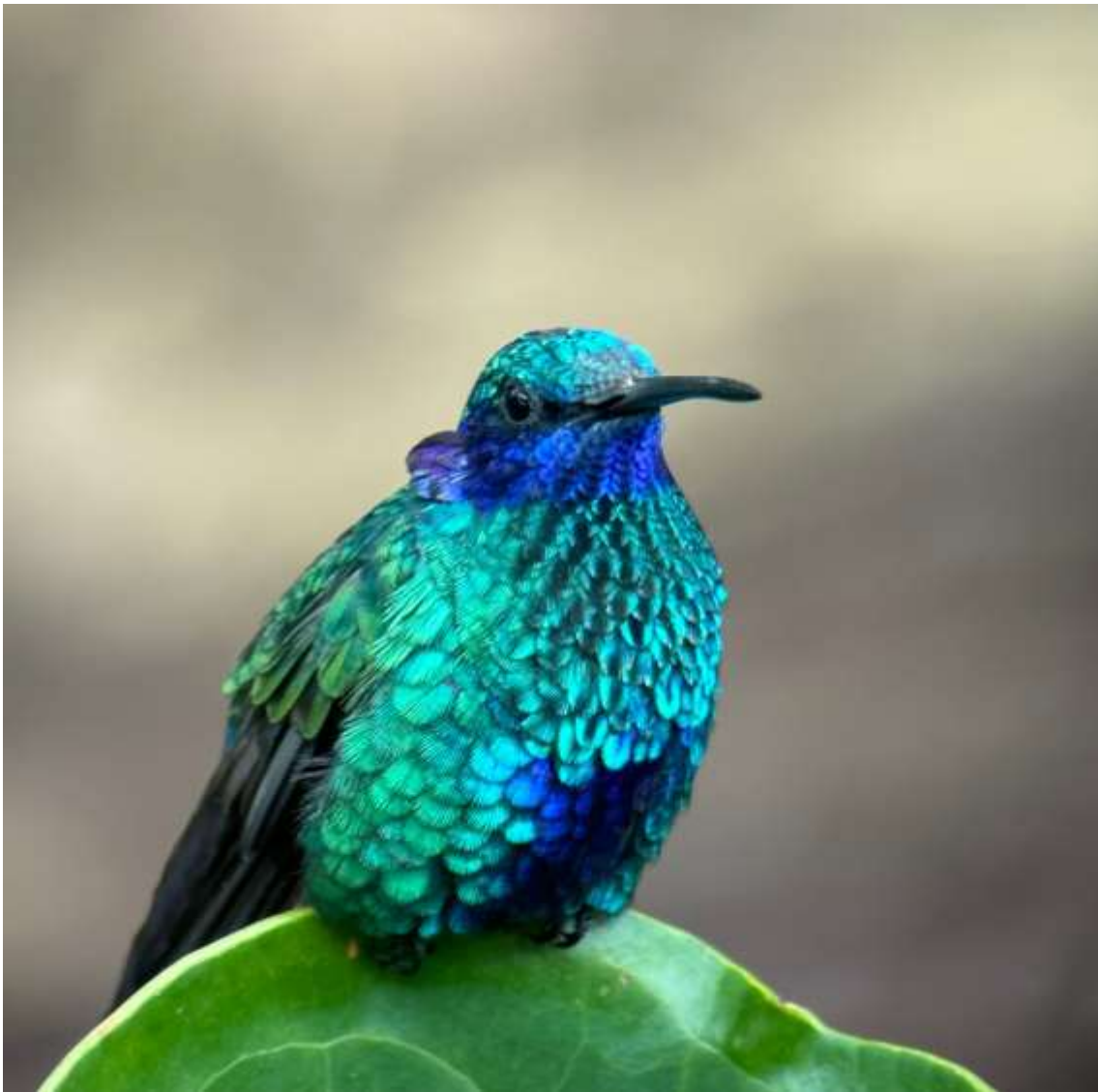
Sparkling Violet-ear

offers a haven for a great diversity of residents and migratory water birds. Birds are usually numerous and relatively easy to see here (elevation of about 10,500 feet) and in the surrounding arid hills. Among the possibilities are White-tufted Grebe, Puna Ibis, Yellow-billed and Puna teals, Yellow-billed Pintail, Andean Duck, Aplomado Falcon (uncommon) Plumbeous Rail, Slate-colored Coot, Andean Lapwing, Andean Gull, Spot-winged Pigeon, Bare-faced Ground-Dove, Andean Flicker, Wren-like Rushbird, Spot-billed and Rufous-naped ground-tyrants, White-browed Chat-Tyrant, Yellow-winged Blackbird, Band-tailed Seedeater, and Greenish Yellow-Finch. This also is an excellent location in which to look for the spectacular Bearded Mountaineer, a hummingbird endemic to Peru. Black-tailed and Green-tailed trainbearers and Sparkling Violetear are seen here occasionally. After enjoying a delicious lunch amidst the stunning lagoon backdrop we'll proceed and venture to the awe-inspiring Rumiqlqa Gate (meaning stone gate in "Quechua") a significant checkpoint that historically regulated the movement of people, animals and goods within the southern region