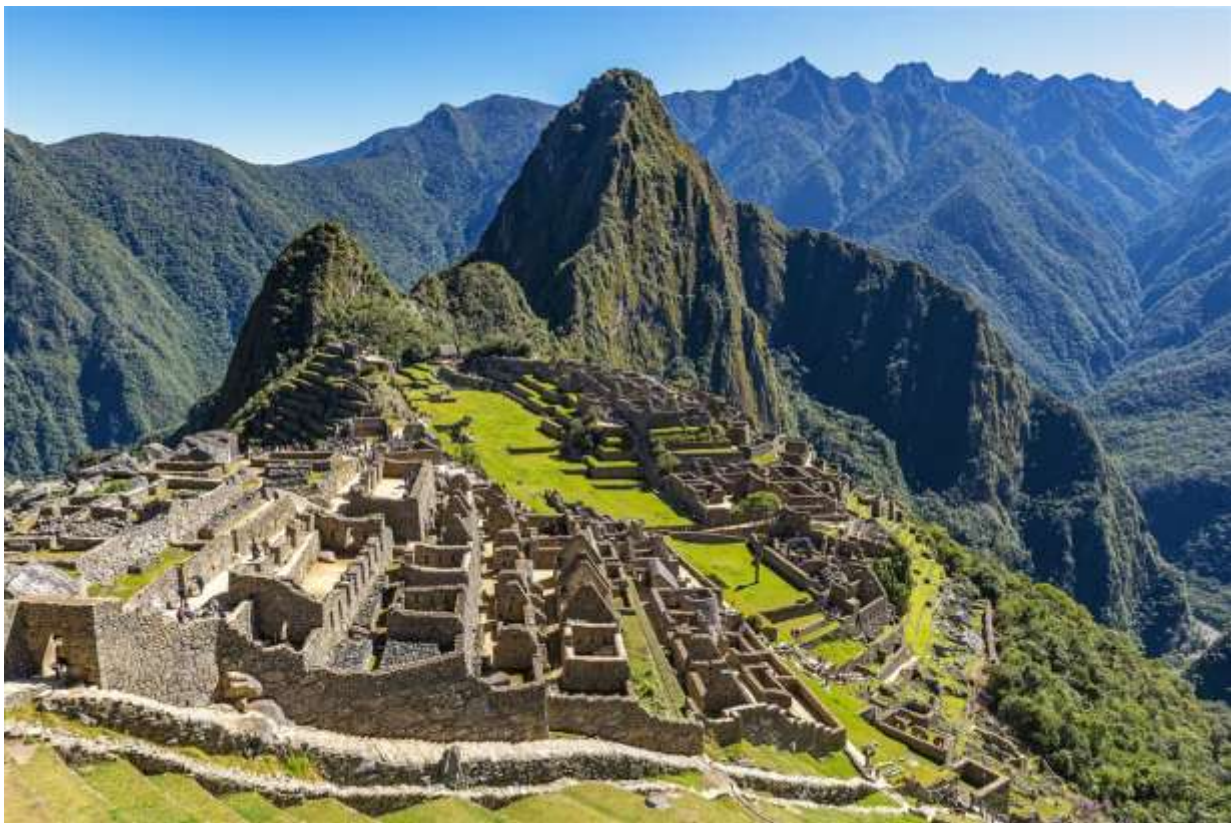
Machu Picchu

Join us on this exquisite adventure, where birding and cultural immersion intertwine for a complete and well-balanced travel experience. We'll discover the wonders of Peru's most iconic historic sites and grandest landscapes, ranging from Cuzco—the ancient Inca capital rich with architectural treasures—to awe-inspiring Machu Picchu, and from the celebrated Sacred Valley of the Incas to breathtaking Apurimac Canyon, home to majestic Andean Condors.