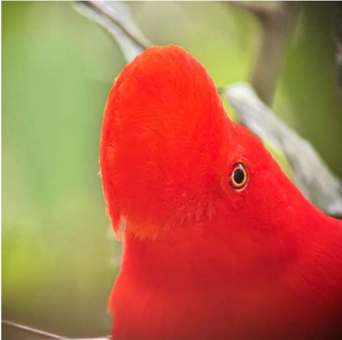
Andean Cock of the Rock Male