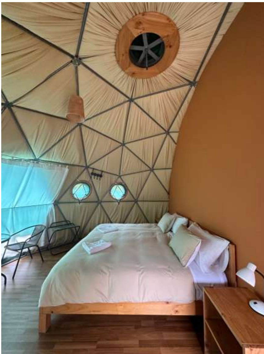
Glamping Apurimac Valley

Koricancha Temple of the Sun, boasting exquisite architectural marvels crafted during the reign of the renowned Pachacuti Inca, the ninth sovereign. Once adorned with sheets of gold and silver, this site was revered as the sacred abode of deities such as the sun, moon and other celestial