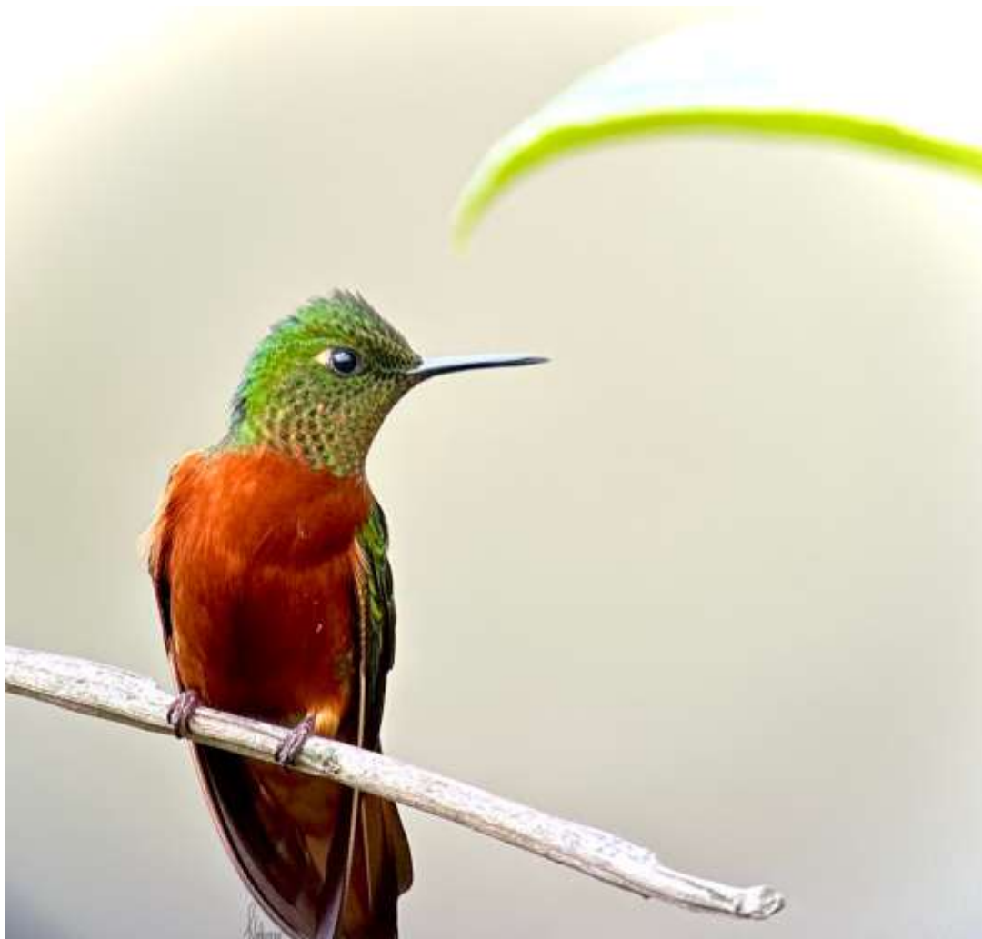
Chestnut-breasted Coronet

our inn, in search of the elusive endemics Apurimac Spinetail and Brushfinch. Additionally keep an eye out for other prized sightings, including the striking White-eared Puffbird, Golden-billed Saltator, Mitred Parakeet, Sparkling Violetear, Aplomado Falcon, Black-chested Buzzard Eagle and the captivating Purple-backed Thornbill.